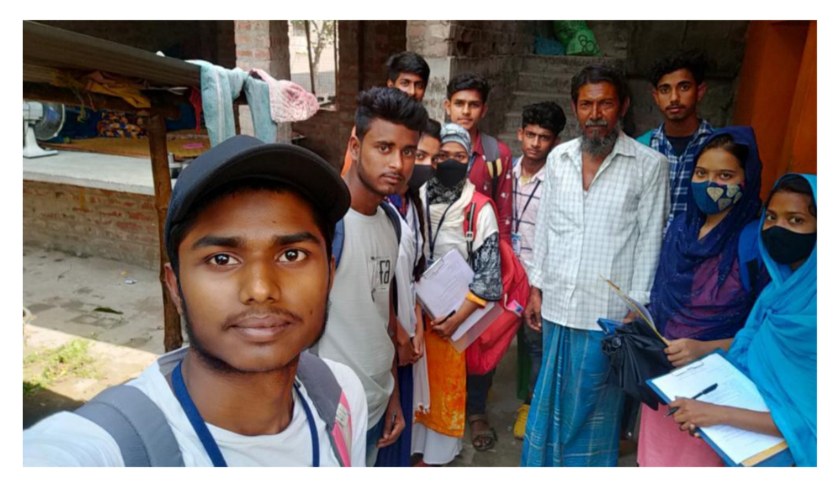
Survey is going on-3 Dated-23<sup>th</sup> April 2022