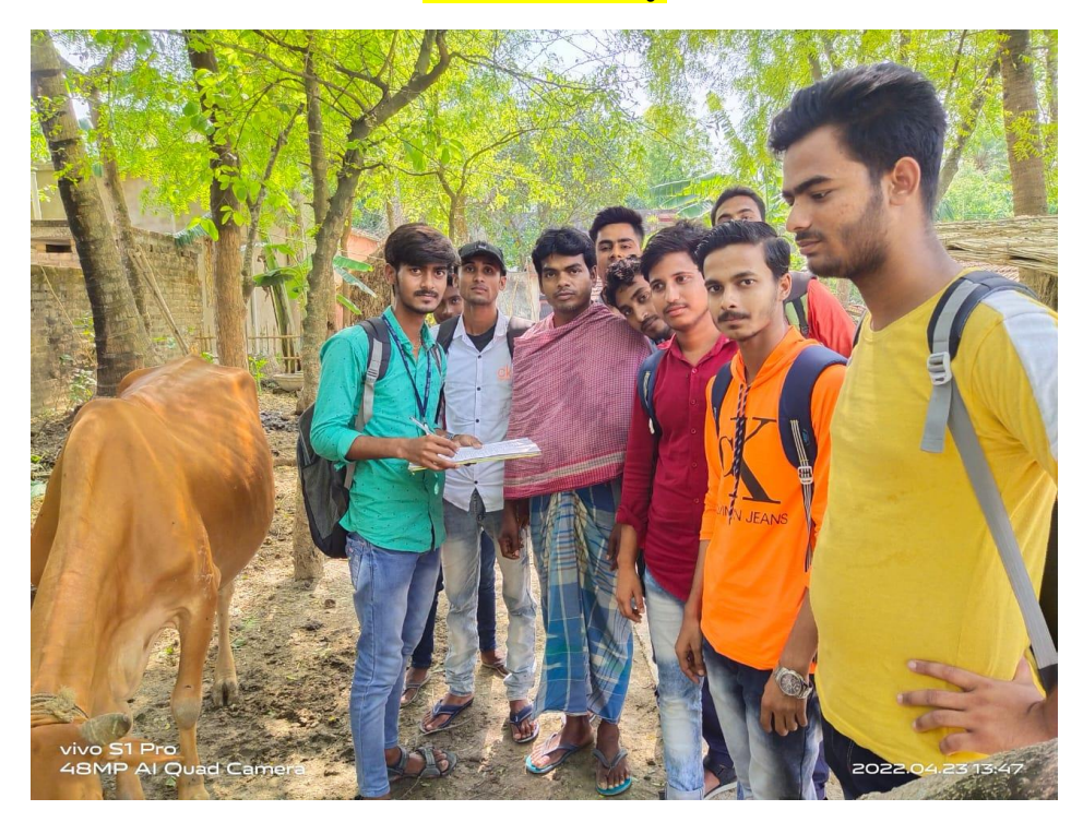
Survey is going on -1 Dated-23<sup>th</sup> April 2022